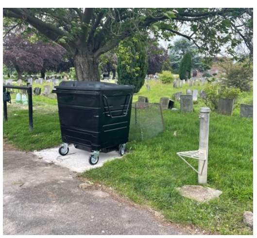
Black Euro-bins at MSJC