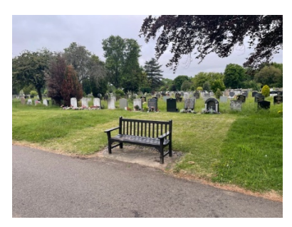
Grass swathes cut on main access paths and around features